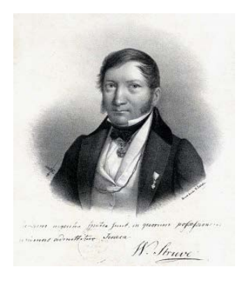
Fig. 2: Wilhelm Struve (1793– 1864). Portrait by Eduard Hau (1837) http://commons.wikimedia.org/wiki/ File:Wilhelm_Struve._1837.jpg

Consequently, Gauß connects his arc measurement not only to the Danish meridian arc in the north, and – after proper extension – to the Krayenhoff triangulation of the Netherlands, but also to the triangulation of Müffling and to the geodetic survey of Hesse. He also thinks to include the triangulations carried out by Bohnenberger in Württemberg and by Eckhardt in the grand duchy of Hessen-Darmstadt into a future European network. Gauß ' intention obviously is the common adjustment of a central European arc from Denmark to Italy, using the original data. Unfortunately, his endeavours to get the observations of Soldner from the Bavarian government lead to a success only in 1827 – at that time Gauß had already given up his plan of a large-scale computation (Großmann 1955).