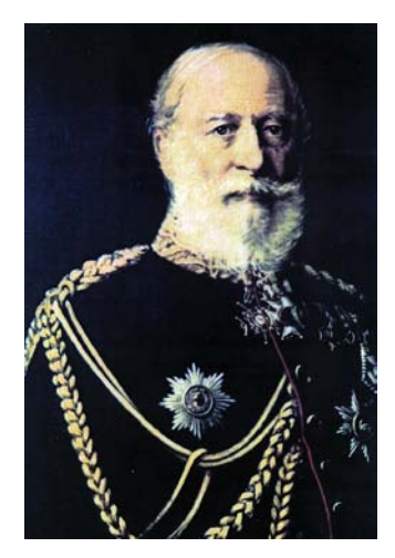
Fig. 4: Johann Jacob Baeyer (1794–1885), founder of the "Mitteleuropäische Gradmessung". Oilpainting by Stankiewicz Deutsches Geoforschungszentrum Potsdam, from Buschmann (1994)

After the East Prussian arc measurement Baever promotes rapidly, and finally leads the trigonometric department of the General Staff (1843-1857). Under his direction, new triangulation chains are spread out over Prussia, which now follow the high standards set by Bessel. Further on, proper connections to neighbouring countries play an important role. The "Küstenvermessung" (1837-1842) connects the trigonometric network in East Prussia with the Danish triangulation, and the later fundamental station Rauenberg originates from a chain to the triangulation around Berlin (1842-1845). The scale of the Prussian first order triangulation is improved by additional baselines, and the connection to the Russian triangulation is strengthened by further ties. Scale comparisons between the Russian and the Prussian baselines and studies on the mean sea level of the Baltic Sea already indicate focal points of the later "Mitteleuropäische Gradmessung", coming into existence with the approval of Baeyer's "Entwurf zu einer mitteleuropäischen Gradmessung" (1861), see below. The idea to this proposal certainly builds up on the well-known considerations of Zach, Gauß, Müffling,